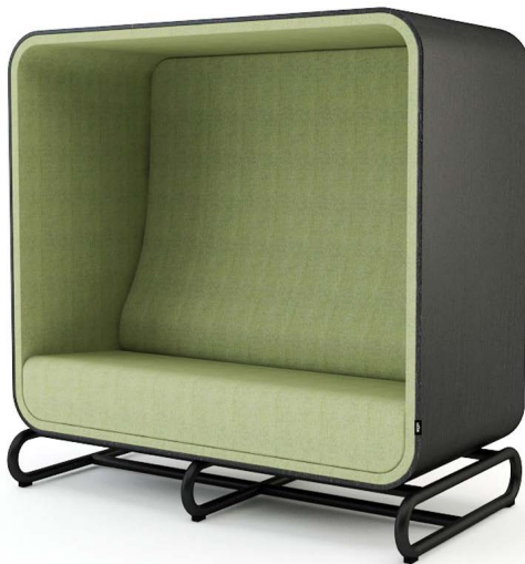
201M METAL BASE