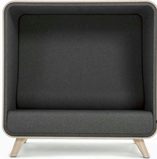
201W WOODEN BASE