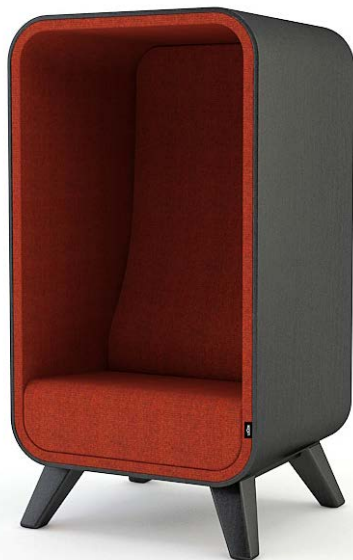
201W WOODEN BASE