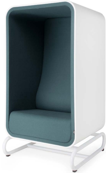
201M METAL BASE