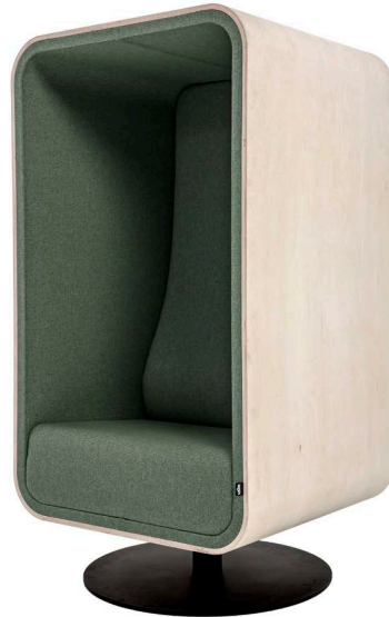
201S SWIVEL BASE