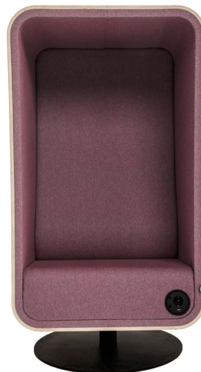
201S W/ POWER SOCKET