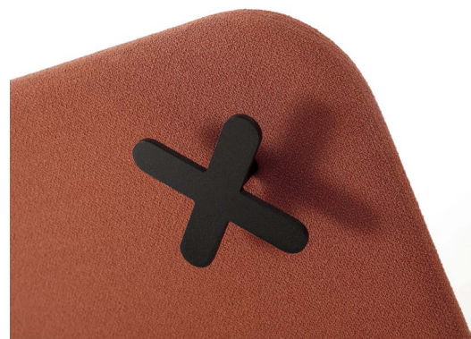
305X NUGGET X-HANGER