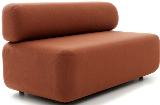
305 NUGGET SOFA