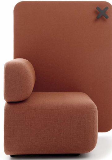
305SR NUGGET SCREEN RIGHT