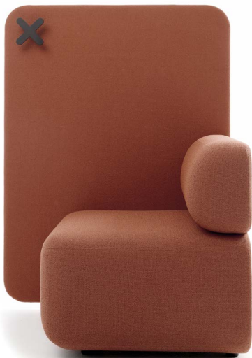
305SL NUGGET SCREEN LEFT