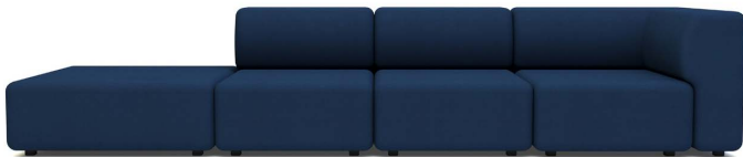
304N5 A NORMAL SOFA NO.5