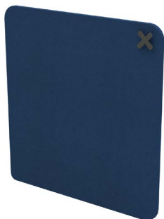
304S A NORMAL SOFA SCREEN