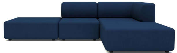
304N4 A NORMAL SOFA NO.4