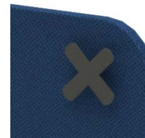
304X A NORMAL SOFA X-HANGER