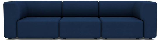
304N2 A NORMAL SOFA NO.2