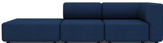
304N3 A NORMAL SOFA NO.3