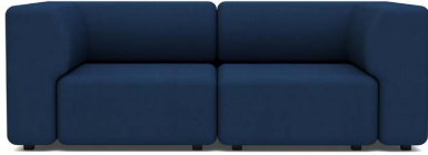
304N1 A NORMAL SOFA NO.1