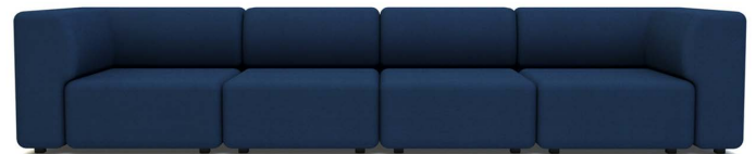
304N6 A NORMAL SOFA NO.6